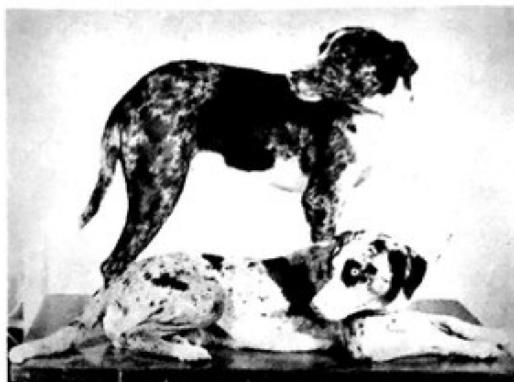
Catahoula Leopard Cowdogs owned by Stodghill's Ranch, Quinlan, Texas. These dogs show true Catahoula type and the best color.

We have been talking about such a trip for the past year, so we really enjoyed ourselves. We hope to do the same out Texas way one of these days!