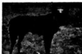
This is our "Lady"