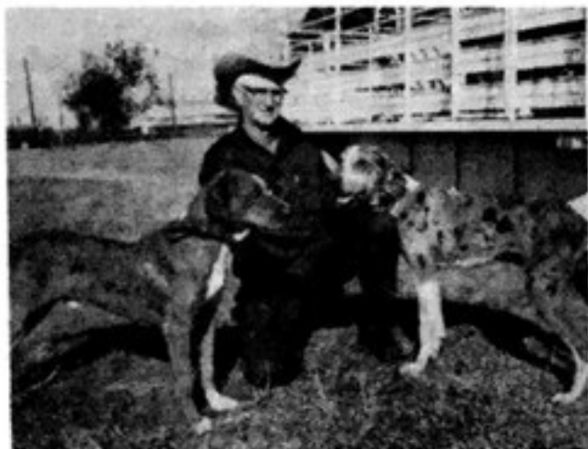
Piney Wood Lep & Old Lonesome. Lep has Double Blue Eyes, Lonesome has Brown Eyes. Notice high flanks. These dogs can move and stay, breed for this type. Visitors welcome to see these dogs work. Stodghill Ranch

This breeding would be Clock-wise in a way, except for the easily discernable relation of the females. But first I must know which parent throws the blue, although it appears to me that they both do!