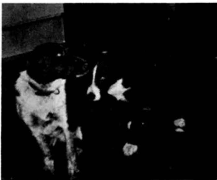
The above dogs are McNab Shepherds, "Tippy" and "Leggs". They are both owned by Mr. Buzz Orton of Elk Mountain, Wyoming.

WEIGHT AND HEIGHT: Adult bitches weight is from approximately 90 pounds upwards, whereas adult dogs weigh from 100 pounds upwards. Bitches stand from 26 inches at the shoulder upwards, dogs 27 inches upwards. Height and substance are important but whole body must be in proportion as described above.