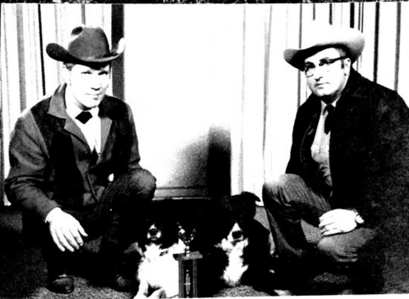
ARF SHEEP DOG TRIAL WINNERS