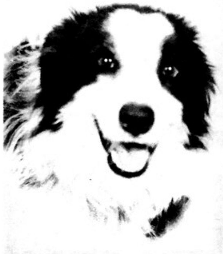
Border Collie headstudy - good representative of the breed. Unfortunately, dog's name and owner are unknown.