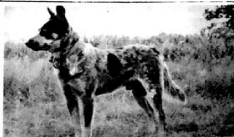
AT STUD "Lee Blue Heeler" ARF No. 259

Rt. 1 - Box 462 Azle, Texas 76020 (Phone: 817 - 448-8523)