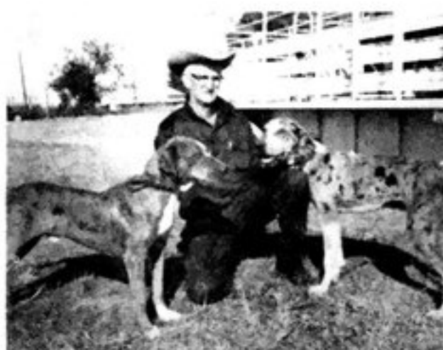
Piney Wood Lep & Old Lonesome. Lep has Double Blue Eyes, Lonesome has Brown Eyes. Notice high flanks. These dogs can move and stay, breed for this type. Visitors welcome to see these dogs work. Stodghill Ranch

that have to use dogs to pen the sows and pigs. If a pig tried to get away, the French Catahoula had that natural style of work to put a pig back with its mother. A dog that can work pigs, sows, cows and baby calves are the most valuable of all Catahoula Leopard Dogs and if you had a 100% French Catahoula Leopard, you wouldn't need a Border Collie for pigs and baby calves or need a bulldog for old rough bulls and wild boars, because the French Catahoula knows how to get rough but is intelligent enough to take it easy on the pigs and baby calves the same as the most advanced Border Collies do.