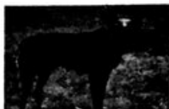
This is our "Lady" ARF Registered Australian CattleDog Pups available out of this beautiful good working dog. Pups whelped 1-29-71.