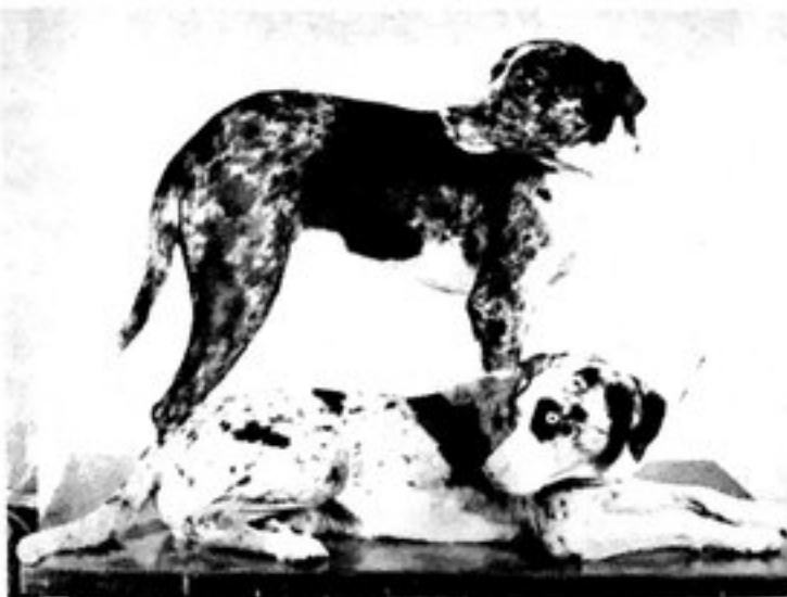
Catahoula Leopard Cowdogs owned by Stodghill's Ranch, Quinlan, Texas. These dogs show true Catahoula type and the best color.

Remember this -- the Plott Hound is only a hound used to trail, bay and corner bear and hogs, mostly bear. Have you ever heard of a Plott Hound driving cattle? Can the Plott Hound drive cattle? The simple answer is NO. The Catahoula is not simply a hound. He can do a hound's work trailing wild hogs (bear too if so trained) but he can outdo a hound once the hog or bear is cornered, in his ability to duck and dodge with greater strength. In addition, the Catahoula can tend and drive cattle! This is not a characteristic of the Hound.