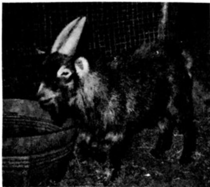
"Panda", a silver black. The tub will give you an idea how tall the African Pygmy Goat is.