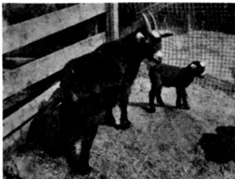
"Frosty" and 8 day old "Tillie".

In regard to color, they are black, silver black and silver blue. The blue shades are in demand.