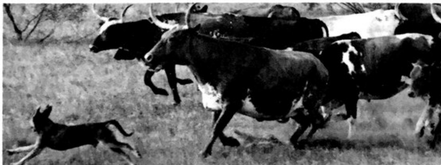
I train unrelated pairs of pups, started cowhedogs

JIM DOTY Anvil Ranch 5654 N. Buchnech Bradford, Ohio 45308