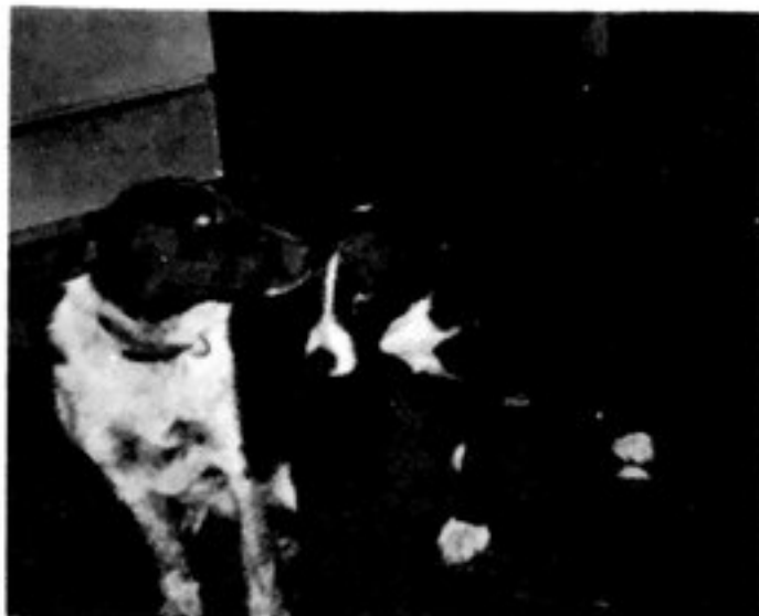
4 month old "Tippy" and 9 month old "Leggs". McNabs owned by Buzz Orton of Elk Mountain, Wyoming.