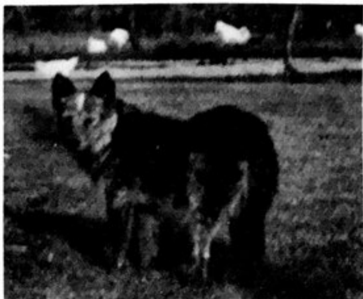
Australian Cattle Dog "Meyer's Smokey" pictured above. Dog is ARF registered No. 600, Vol. 6.