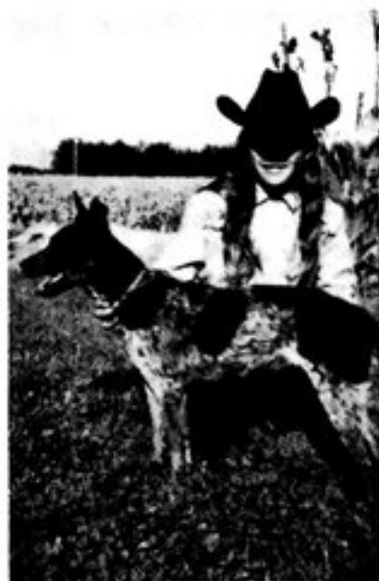
SMITHFIELD STUBBY BLUE HEELER