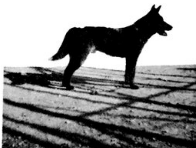
"Tot 'O" Australian CattleDog ARF No. 58, Vol. 1 Pups Unrelated Pairs