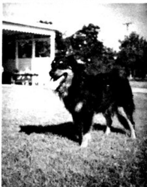
LUCKY SHEP TRUE BLACK-TAN ENGLISH SHEPHERD