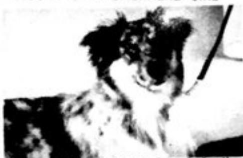
COTTON'S BLUE BOBBY, 20" & 36 lbs. At Stud