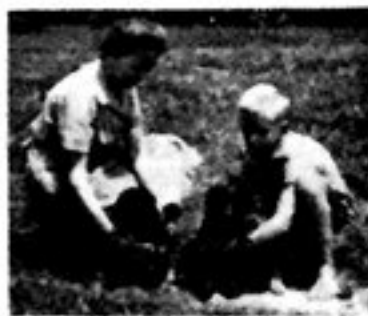
English Shepherd Pups For Sale