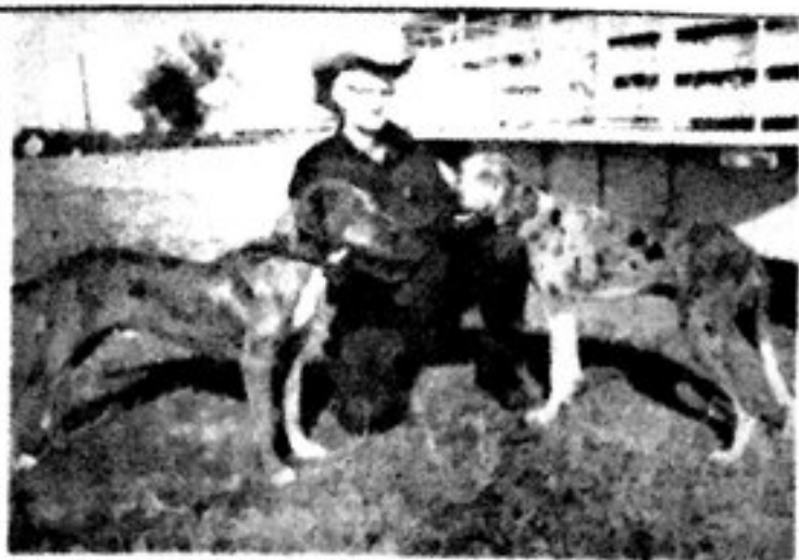
Piney Wood Lep & Old Lonesome. Lep has Double Blue Eyes, Lonesome has Brown Eyes. Notice high flanks. These dogs can move and stay, breed for this type. Visitors welcome to see these dogs work. Stodghill Ranch

TOM D. STODGHILL Quinlan, Texas 75474 Phone: EL 6-2267