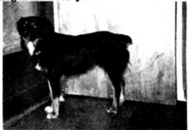
"REBEL" May's Adobe Rebel

East Texas pastures are gaining on West Texas as people are testing the soil, sodding all kinds of grasses and clover with good sandy soil, gets more rain than West Texas and adding mineral and fertilizer to the soil, East Texas is raising more cattle as you can raise so much hay and pasture most of the time and often have winter pasture all winter. In selecting breeding stock, don't let good feed and management fool you!