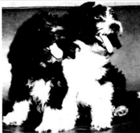
"AMERICAN SHAGGY SHEEPDOGS"